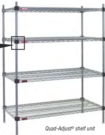
Quad-Adjust® shelf unit