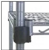
channel of shelf corner fits into slot of collar attached to split sleeve