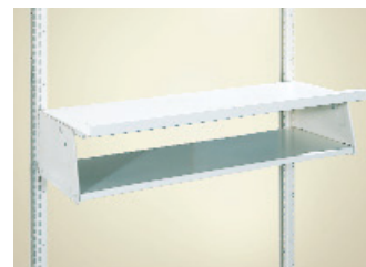
Periodical Display Shelf (Open) Hinged and sloped display surface is 14" (355 mm) high. Flat storage shelf is 12" (305 mm) deep.

FOR A MORE COMPLETE INVENTORY OF ACCESSORIES AND OPTIONS, SEE SPACESAVER'S LIBRARY SHELVING CATALOG.