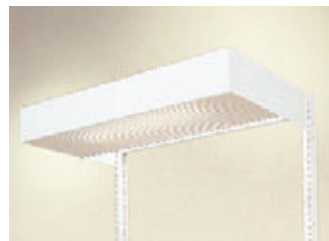
Canopy Light Illuminates display shelves and brightens dimly lit alcoves. Includes white prismatic diffuser.