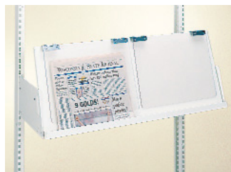
Periodical Display Shelf (Closed) Hinged with plexiglass cover. Sloped display is 14" (355 mm) high. Flat storage shelf is 12" (305 mm) deep.