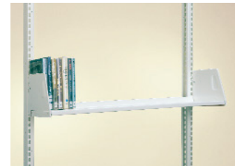
Sloped Adjustable Shelves With Integral Low-Back Shelf is sloped to aid viewing of displayed items. Unit is compatible with integral low-back dividers.