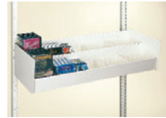
Two-Tier Multimedia Browsing Box Divider type – each 36" wide (914 mm) unit stores approximately 48 VHS or 110 CDs.