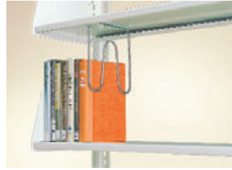
Snap-In Hanging Wire Support Available in four different sizes.