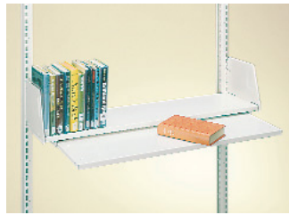
Pull-Out Reference Shelf For convenience in referencing shelved materials. 50 lb. (23 kg) load capacity.