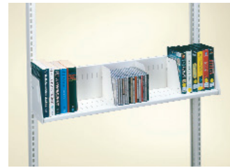
Multimedia Shelf Each shelf will hold approximately 26 VHS tapes or 80 CDs. Can also be used to store paperback media.