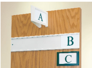
Aisle Identification Options Optional range finders and card holders make locating and reshelving of materials fast and easy.