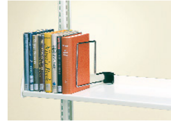
Integral Low-Back Dividers For low-back shelves, available in three sizes for five different shelf depths.