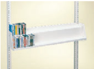
Two-Tier Audio Cassette Tape Shelf Each 36" (914 mm) shelf holds approximately 100 audio cassette tapes (50 per tier).