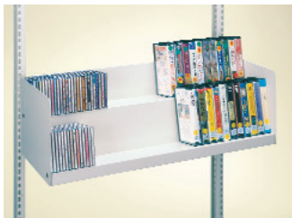
Two-Tier Sloped VHS & CD Shelf Each 36" (914 mm) shelf holds approximately 56 VHS tapes (28 per tier) or 168 CDs (84 per tier).