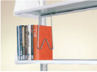
Hanging Wire Support Squeeze type, available in three sizes for five different shelf depths.