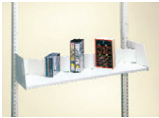
Zig-Zag Display Backstop For merchandising a variety of audio-visual and paperback media.