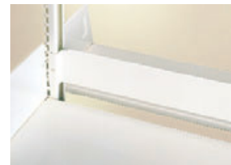
Offset Centerstop Eliminates the need for two independent shelf backstops. Can increase shelf depth by 1" (25 mm).