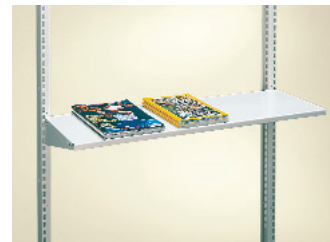
Flat Storage Shelf Includes end brackets – can be used for storage under a fixed display shelf.