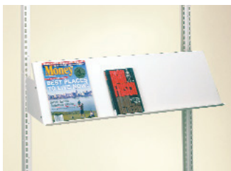
Fixed Display Shelf 11" (279 mm) high – sloped display for merchandising of books, tapes and periodicals.