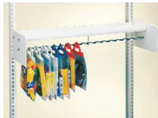
Media Bag Rack Designed to hang large or small media bags from a 36" (914 mm) rod.