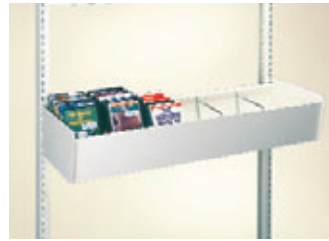
Multimedia Browsing Box Each 36" wide (914 mm) unit stores approximately 42 VHS tapes or 100 CDs.