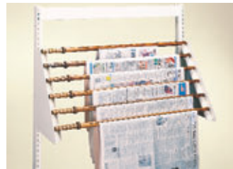
Six-Tier Newspaper Rack Efficiently displays up to six newspapers for easy identification and retrieval.